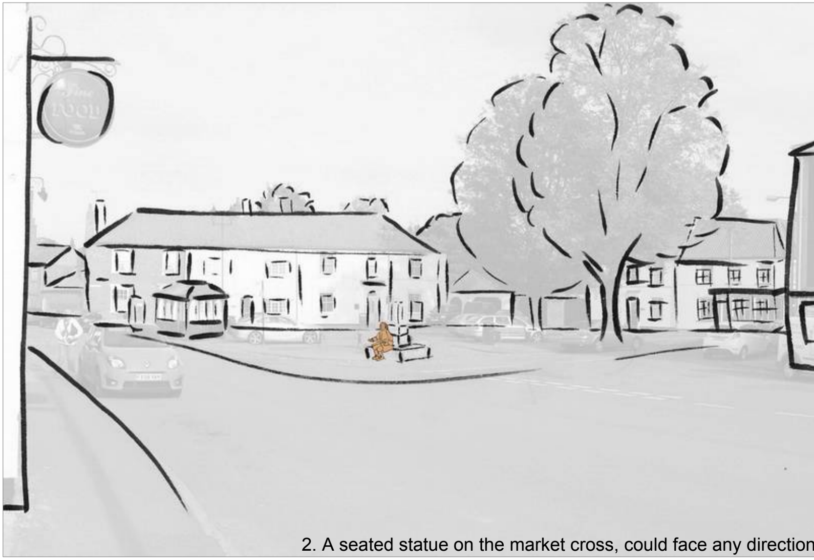
2. A seated statue on the market cross, could face any direction