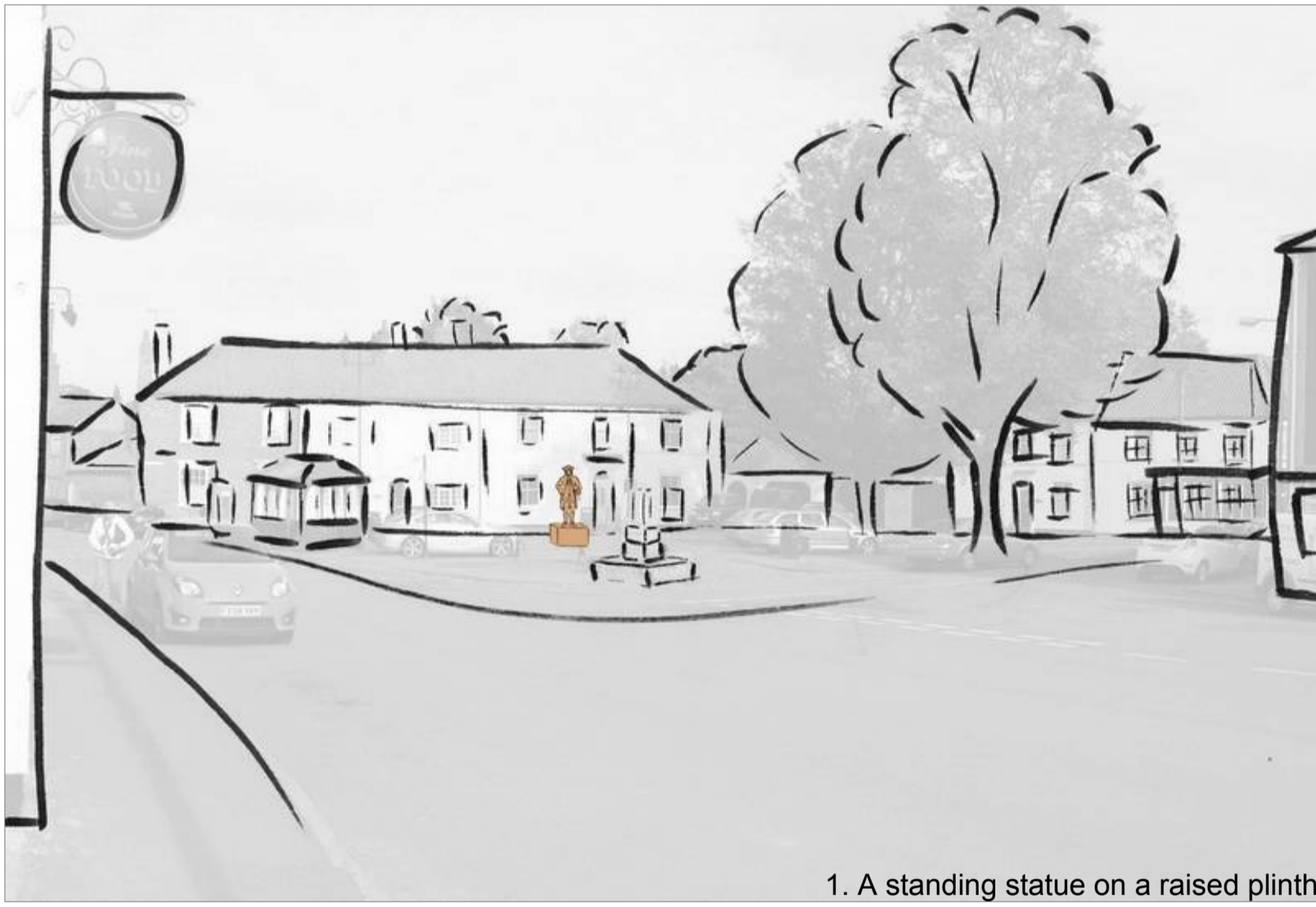
1. A standing statue on a raised plinth