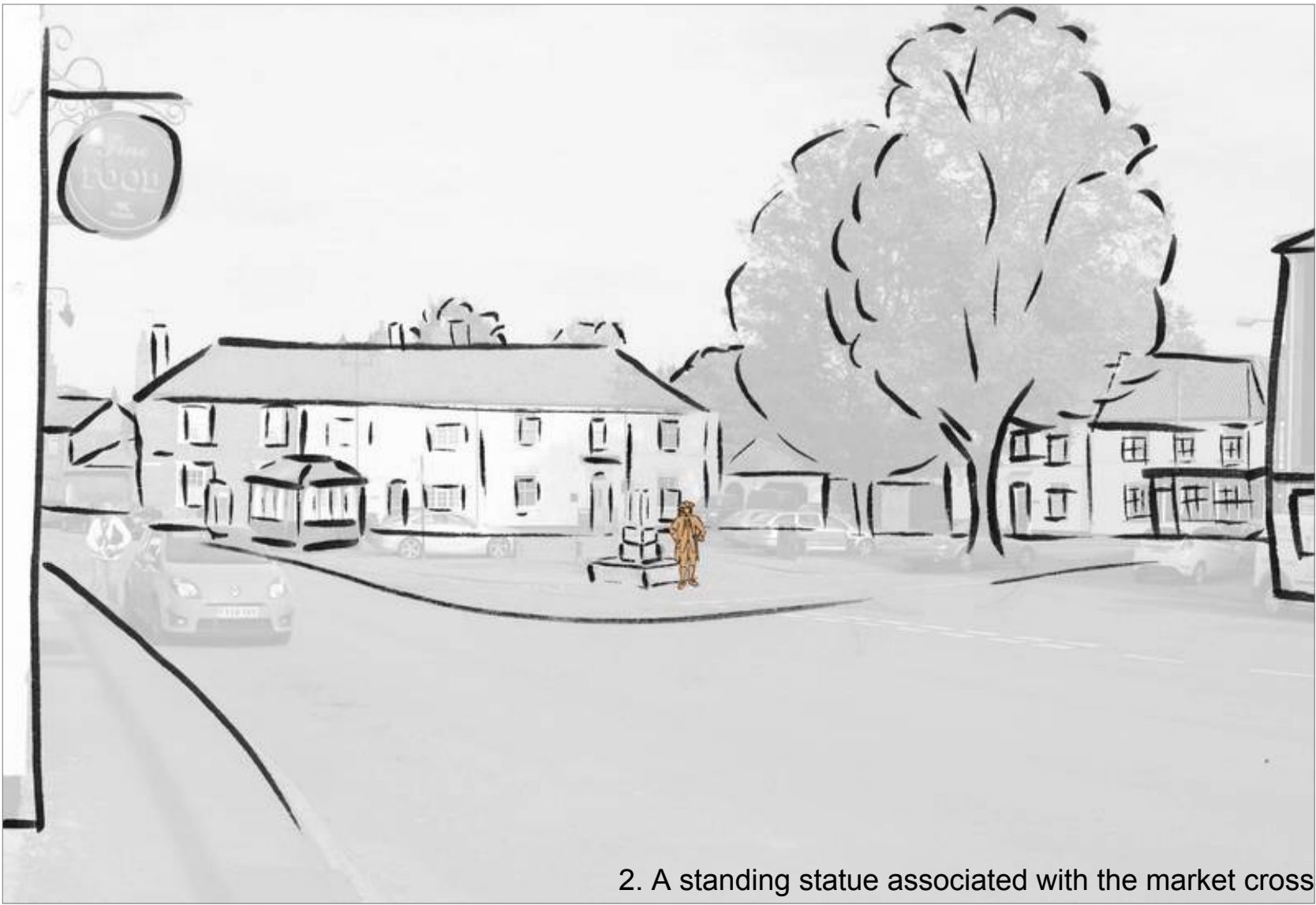
2. A standing statue associated with the market cross