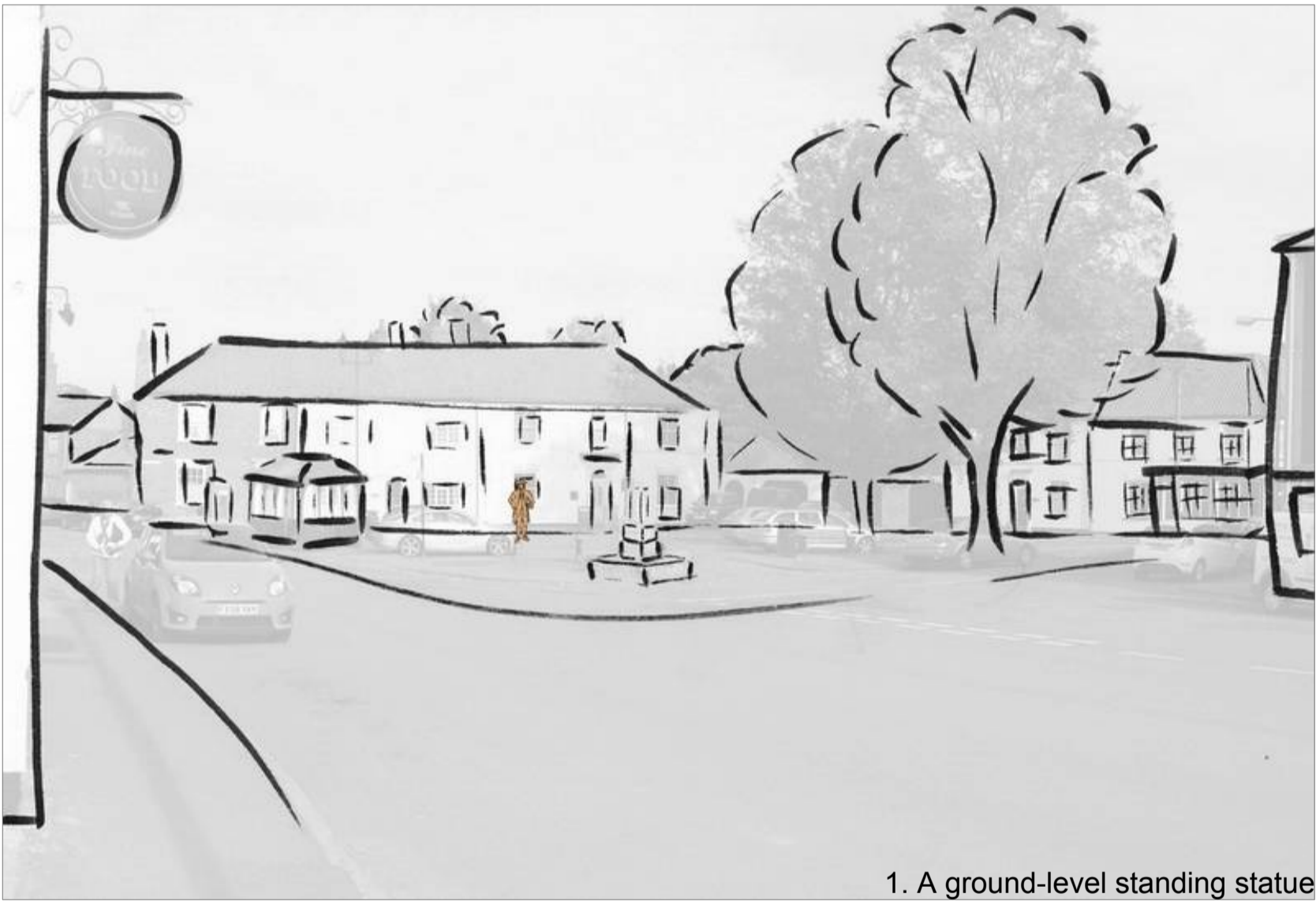
1. A ground-level standing statue